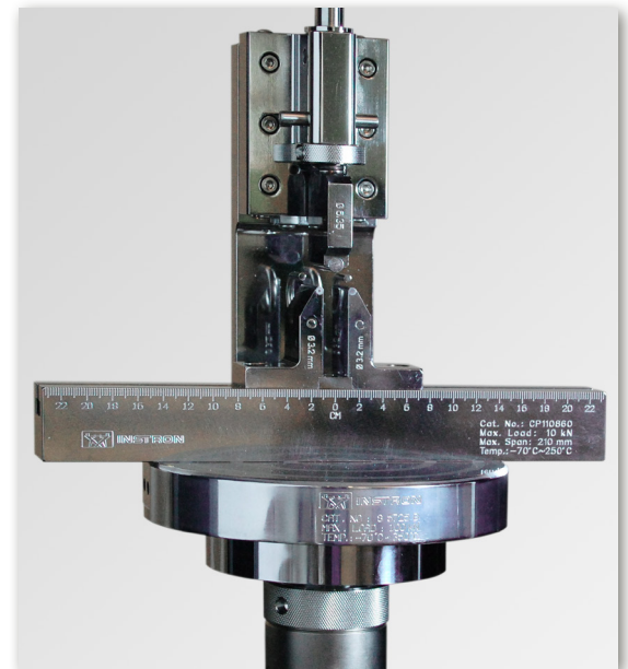
ILSS Testing to ASTM D2344 with CP107574 Anvils on Base Fixture