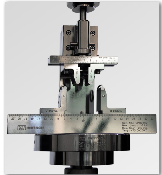
4 pt Flexural Testing with CP106702 Anvils on Base Fixture

Note : *Option is available with independent test certificates